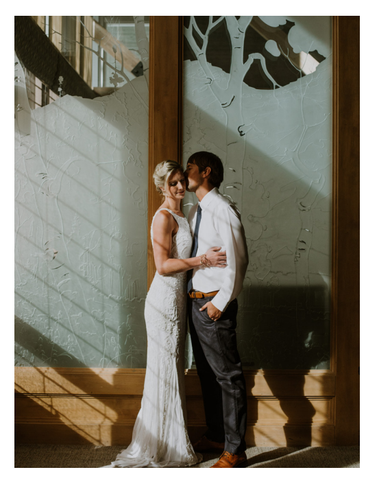
SULTRY HUES AND A MODERN DESIGN WROTE THIS STUNNING LOVE STORY AT TETON PINES COUNTRY CLUB. THE SNOW-CAPPED TETONS INSPIRED THE LOOK, ENHANCED BY WEST-ERN TOUCHES AND REFINED ELEGANCE.